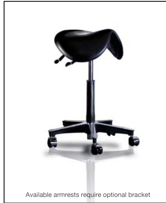
Available armrests require optional bracket

RGP is the leader in ergonomic seating solutions for medical professionals. Our doctor, hygiene and assistant stools have been helping promote good posture for over eleven years.